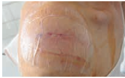
Early detection of infection