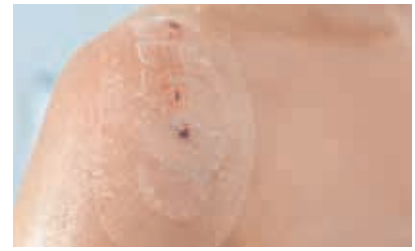
Secure bacteria-proof barrier