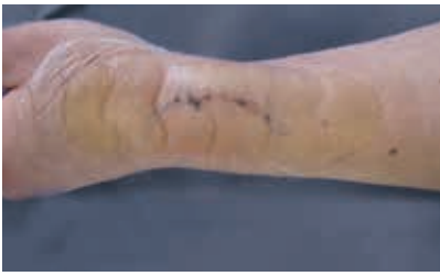
Clear wound visibility